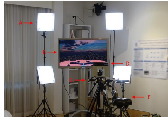
Figure 1: System Setup. A: Face Illumination, B: Display, C: Handlebar and Brake, D: Camera, E: Physical Exergame Controller

In this work three additional scenes are introduced in case a provocation did not work as expected to ensure the Emotional Journey : the Explosion Scene , the Downhill Scene and the Glade Scene .