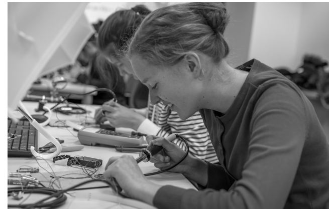
Figure 3: The participants solder the construction kit together.

announcement and stages an aesthetic workshop setting (Figure 1). Technically, the umbrella is converted by the participants to extend the physical world with digital information through a tangible interface [5].