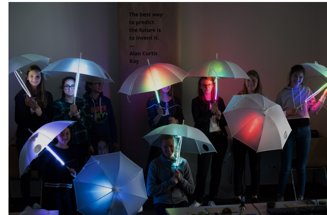
Figure 4: Group photo.

We thank the organization Girls'Day for supporting young females in their future choices by providing such a platform. https://girls-day.de