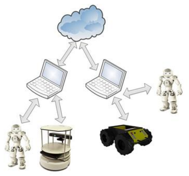
Figure 1: Robots in the cloud [10,13,14]

One of the main problems of the robots is, that they are limited in many ways. The computing power and hardware resources are bound by costs and their physical properties. Moreover, robots are usually on their own and only programmed for one specific area. So the behavior of the robot is greatly limited by inflexible programming. The standard SDK^7 of a robot doesn't provide solutions for sharing executable information with heterogeneous robots. The next figure presents an architecture which provides a knowledge sharing among different robot platforms with the aid of cloud services to solve this problem.